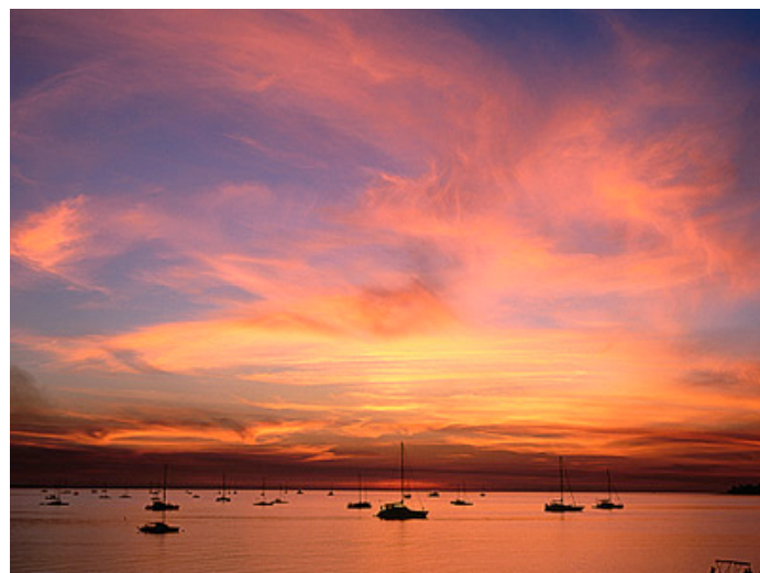
Darwin Sunset Fannie Bay